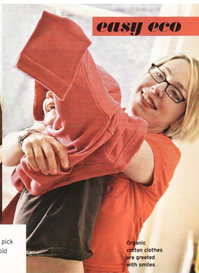
Organic cotton clothes are greeted with smiles

an 'Eco Ball': a plastic ball filled with pellets which is supposed to ionise the water, thus drawing off the dirt. That's the theory. In practice, I have no idea if it works, as when I get the washing out, it doesn't smell of anything, which is the way I normally check if clothes are clean.