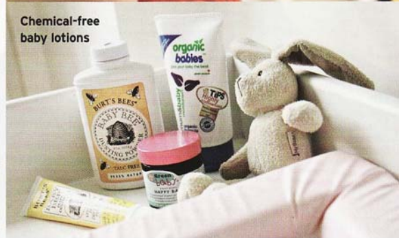
Chemical-free baby lotions

Going eco does come at a price - everything was that little bit more expensive than normal. However, if you're buying less, and keeping things for longer - a key green aim - I imagine it would even out in the long-term. Given time, I might just become a enviromum yet.' □