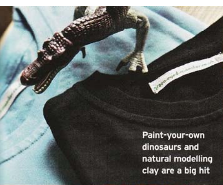
Paint-your-own dinosaurs and natural modelling clay are a big hit